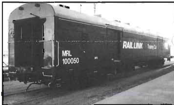
▲ Training Car 100050 was put into service on December 4. See Newsbriefs for more information.